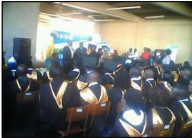
Part of SAAA graduates at the ceremony