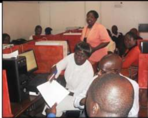
School heads learning the stuff

The initiative was borne out of the desire to ensuring that school heads could be in a