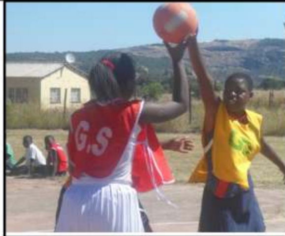
Trust Academy netball player wrestle for ball possession in a match against Murehwa High

In basketball boys lost to Chipadze and Visitation while the girls were outclassed by Monte Casino. The sports director however praised the teams for their performances