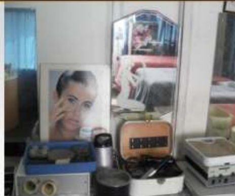
A practical room with all equipment in place ready for

Trust Academy has introduced a new exciting and internationally recognized course in Beauty Therapy which ranges from certificate up to diploma level.